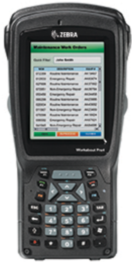
Shown with Numeric keypad. (Workabout Pro 4 Long is shown on the front page with the Alphanumeric keypad.)